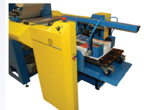
Optional Pallet Stacker